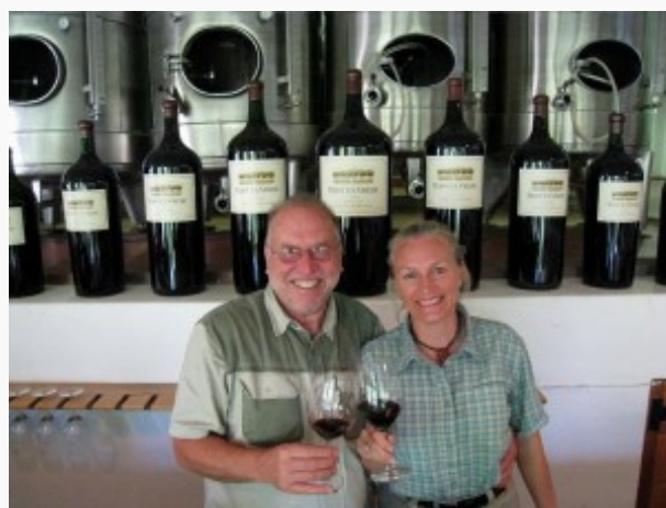
Earlier in the journey