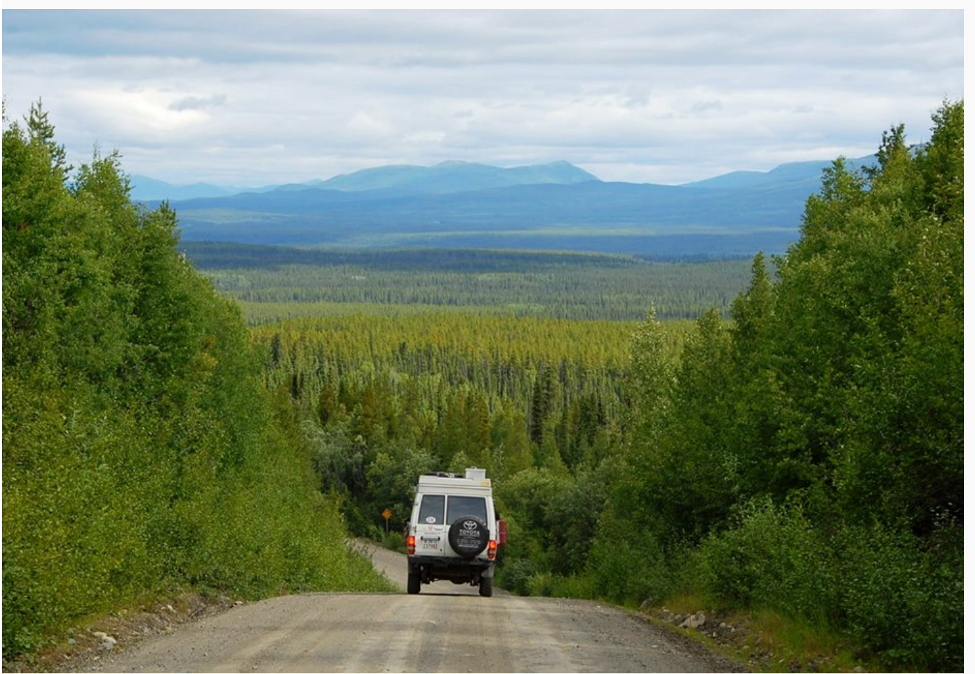
Long and winding road