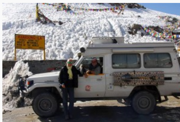
Highest road in the world

On the September 21, 2013, the intrepid duo crossed the Rhine River and completed their circumnavigation of the globe, after 2,573 days. With the diesel rumble of their dependable Land Cruiser still going strong right until the end, a letter the