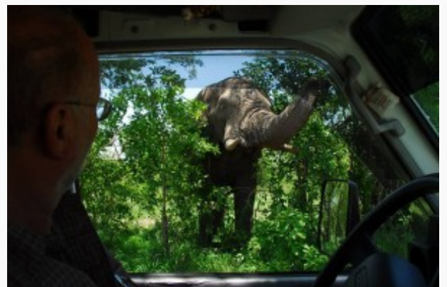
Knock. Knock. Who's there?