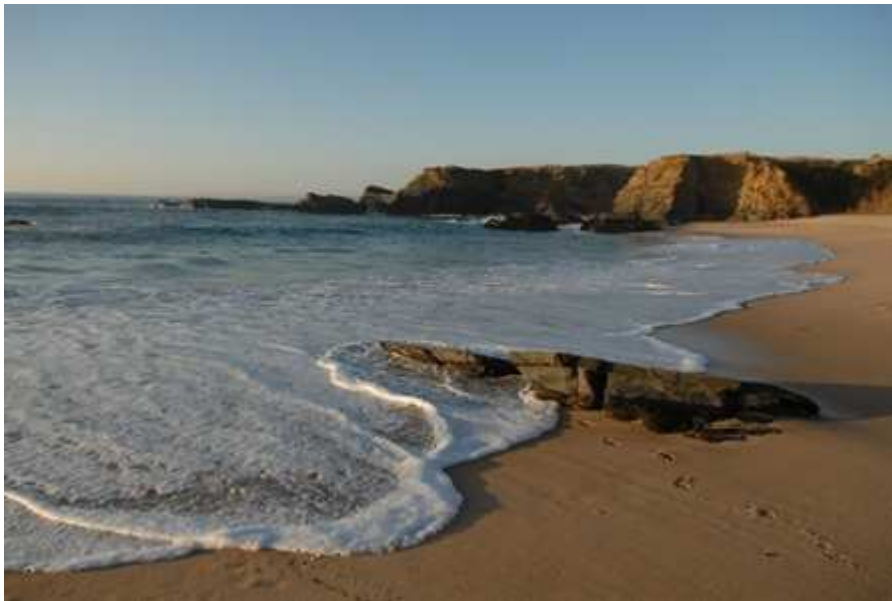
Beaches of Portugal

From Africa, the journey headed north, crossed the Mediterranean, Spain and from Portugal the vehicle was shipped to Buenos Aires in South America. “When we left Europe, there were no signs of any economic crisis around,” she adds.