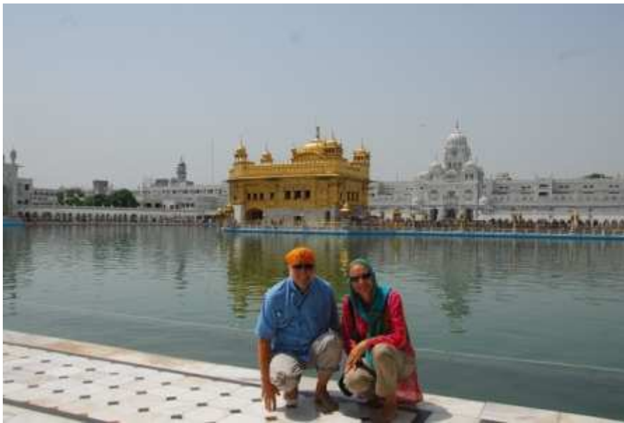
Golden Temple Amritsar