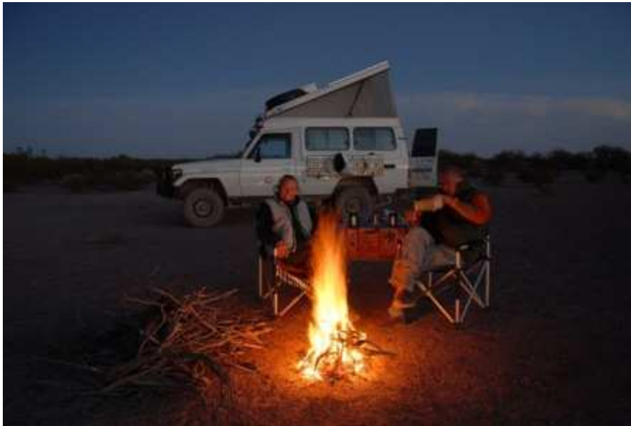
Mexico Desert Fire