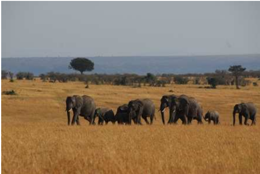
Kenya Masai Mara