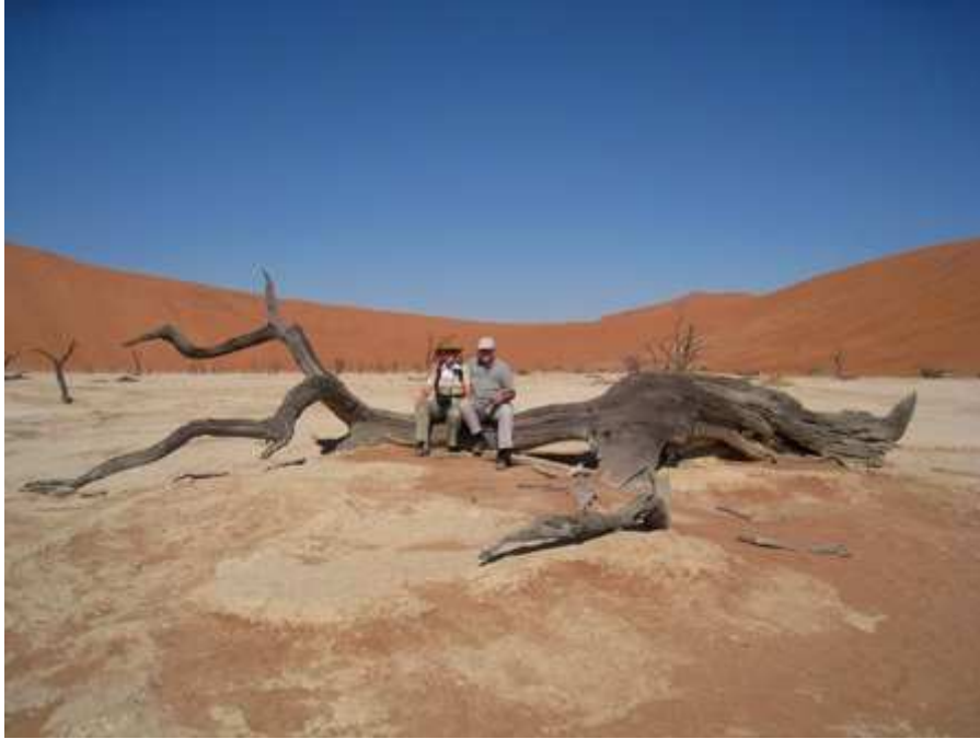
Namibia Death Valley

Driving through 17 African countries, piles of memories the couple recall are shattered farmlands of Zambia, rich wildlife of Africa, scars of genocide in Rwanda, clear waters of Nile sources, malnutrition in Ethiopia and civil strife ridden people of Sudan.